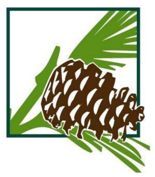
Disclosure Statement May 30, 2019

750 Weaver Dairy Road Chapel Hill, NC 27514